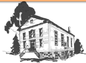
Gates Hall, home to community theatre since 1867.

Special Fundraiser: Join us for Shakespeare and Desserts! Saturday, October 26