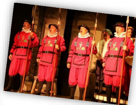
Bravi, tutti! Women and men from the cast of The Yeomen of the Guard , presented July 19-21.