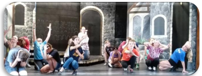
Left and above: H2$ cast hard at work during rehearsals