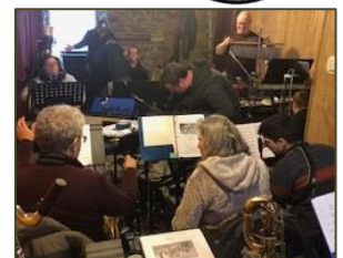
A Gates Hall First: Musicians in the basement for Curtains