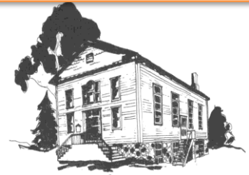
Gates Hall, home to community theatre since 1867.