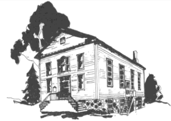
Gates Hall, home to community theatre since 1867.