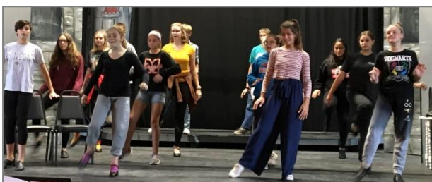
No, No, Nanette cast members work on a dance number

Jimmy and Billy make plans to meet all three girls in Atlantic City to have a little fun before breaking off the continued on p. 3